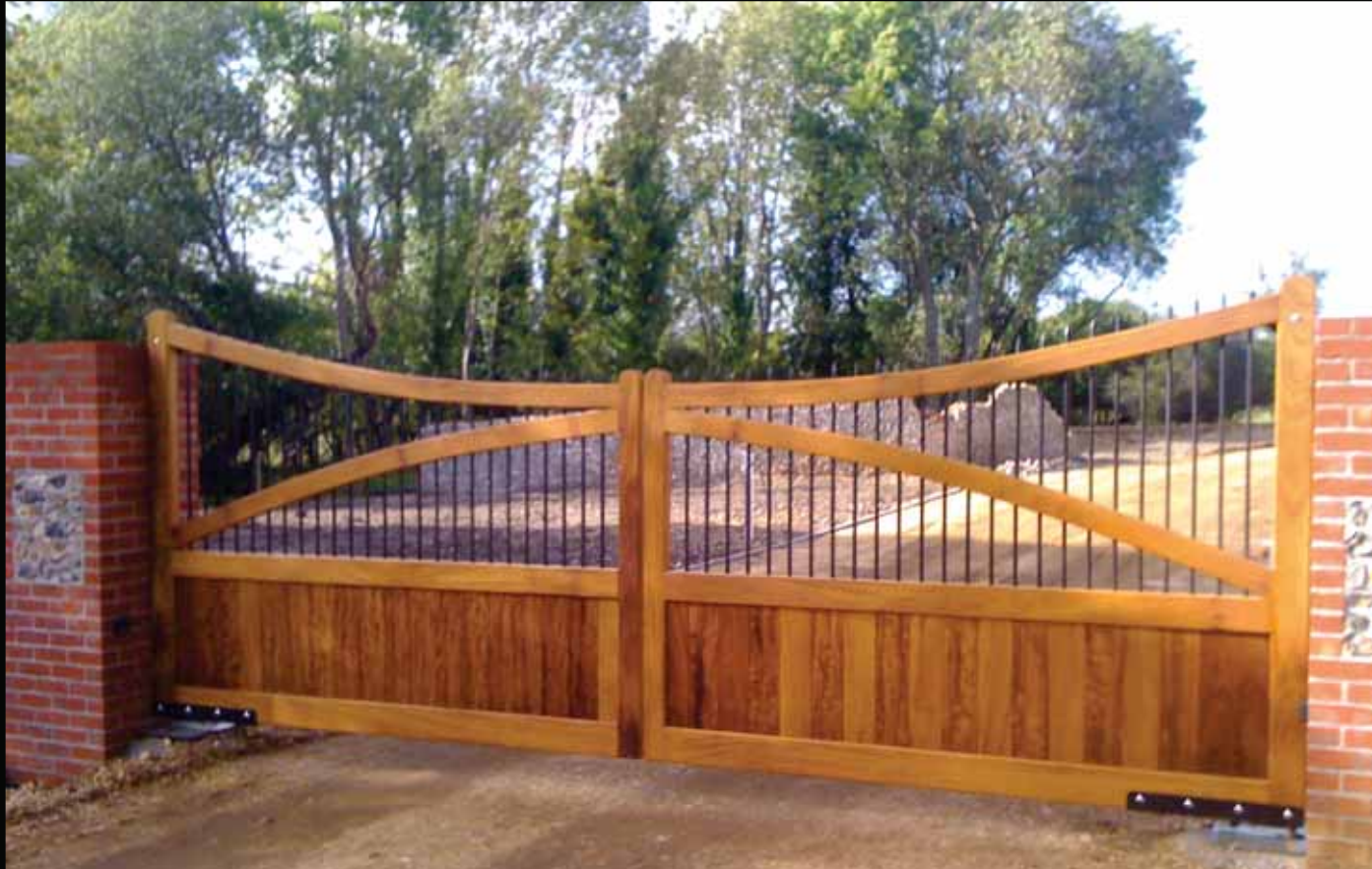
A harmonious blend of iron bars and Iroko hardwood Strength and security Blending seamlessly with rural surroundings