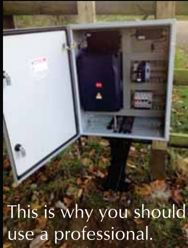
This is why you should use a professional.

In house design and qualified construction technician to oversee installation of brickwork, drive restructuring, surfacing etc.