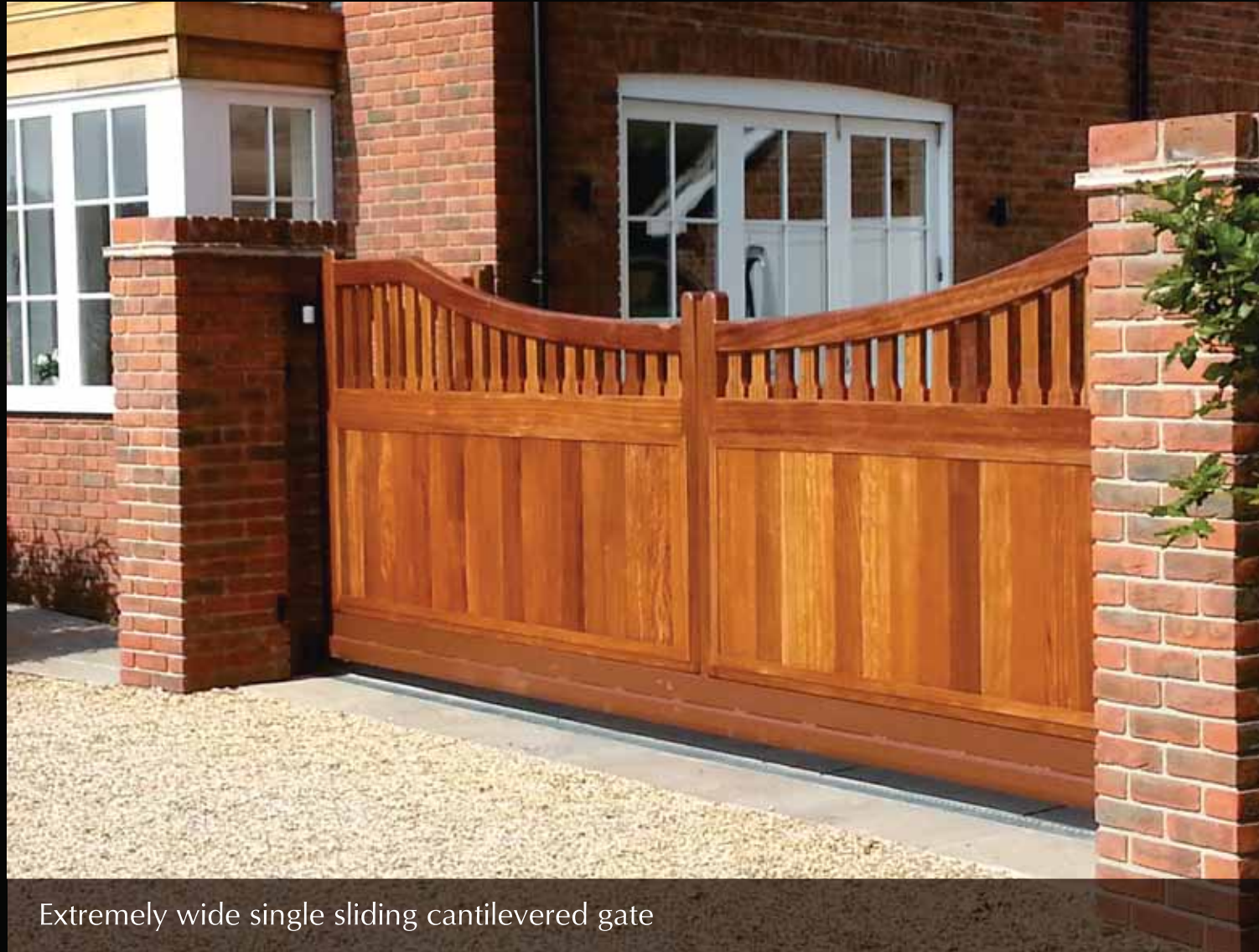
Extremely wide single sliding cantilevered gate

A well designed and installed set of gates will add to the value of your property and will make a statement.